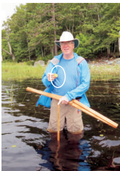
Leaf stalk well over one metre