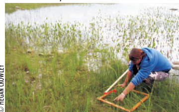
Lakeshore surveys on Lac de l'École