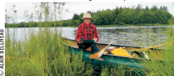
ACPF Volunteer Monitoring Workshop