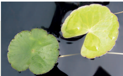
Floating Water-pennywort leaf (l), Floating Heart (r)

( Nymphoides cordata ): Found in similar habitat; heart shaped leaves are notched to leaf centre; stem not erect in shallow water, and leaf undersides purple.