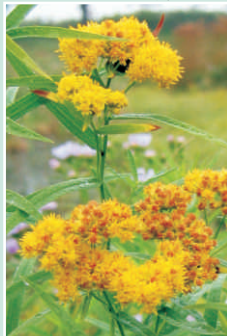
Narrow-Leaved Goldenrod flowers

Similar species: Narrow-Leaved Goldenrod ( Euthamia graminifolia ) is common in a wider variety of habitats throughout the province, has a flat-topped flower cluster (inflorescence) that is 5-20 cm wide and wider leaves (3-12 mm) that are clearly three-veined.