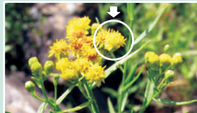
Flower cluster with one flower head circled