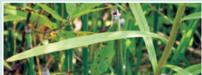
Narrow-Leaved Goldenrod leaves