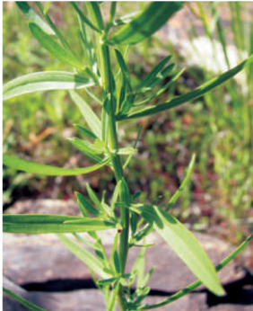
Linear, alternate leaves