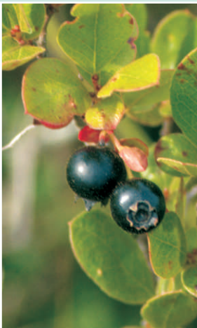
Fruits with soft hairs