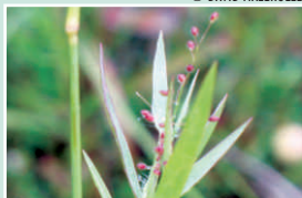
Late summer panicle in the leaf axil