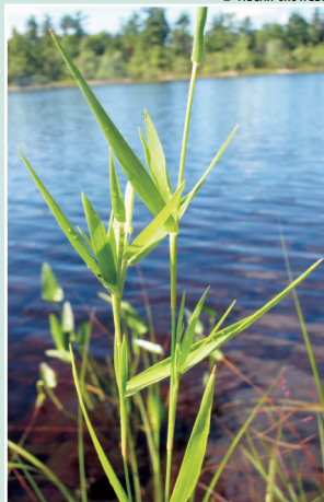
Upward pointing leaves and smaller leaves