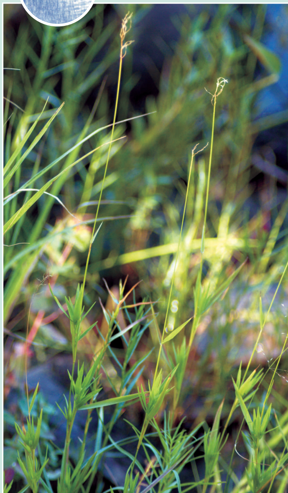
Eaton's Panic Grass with panicles that have dropped their spikelets © ALAIN BELLIVEAU © MEGAN CROWLEY © DAVID MAZEROLLE