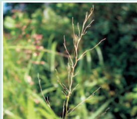
Panicle after the fruit has fallen off