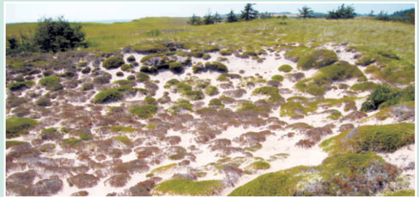
Growing in clumps