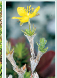
Flower and leaves