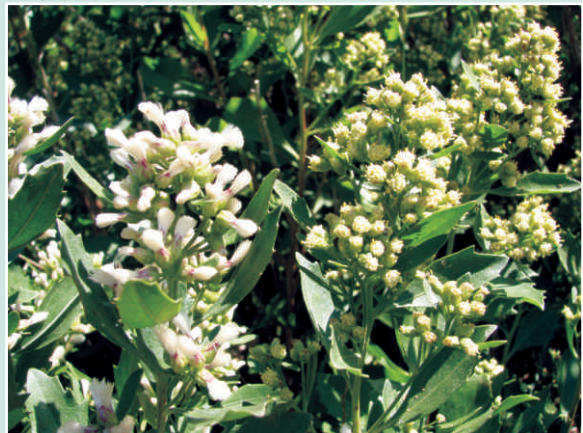
Female (left) and male (right) flowers on two separate shrubs growing close together