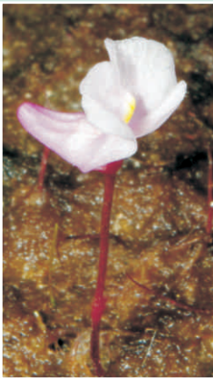
Purple two-lipped flower