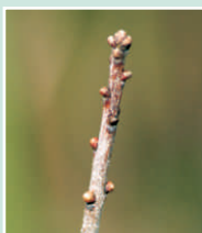
Twig and buds