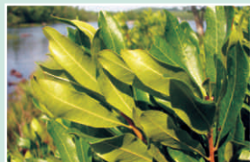
Leaf upper and undersides