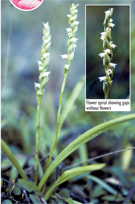
Flower spiral showing gaps without flowers