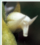
Pointed bottom lip of Nova Scotia Ladies'-tresses