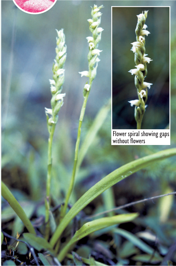
Flower spiral showing gaps without flowers