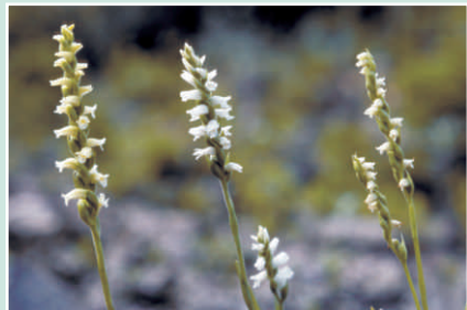
From left to right: Yellow, Nodding, and Case's Ladies'-tresses