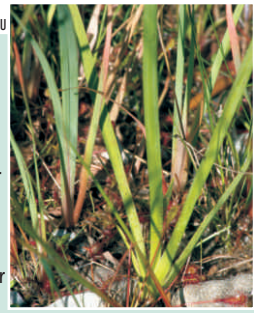
Golden Crest (left), Redroot (right)

When not in flower this plant can look similar to small Blue Flag Iris ( Iris versicolor ) and Golden Crest ( Lophiola aurea - page 15). Redroot has bright green leaves and red underground stems (rhizomes) while the other species have white rhizomes. Golden Crest leaves are blue-green and tinged with red.