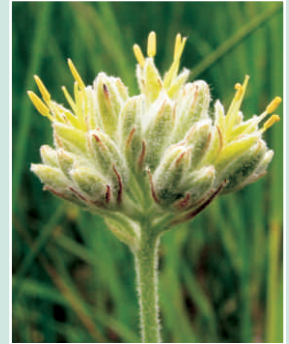
Woolly flowers beginning to open