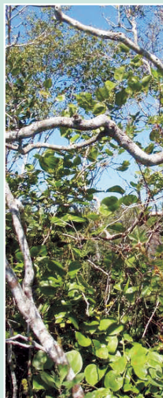
Climbing a tree