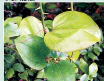
Leaves, thorns and curling strands