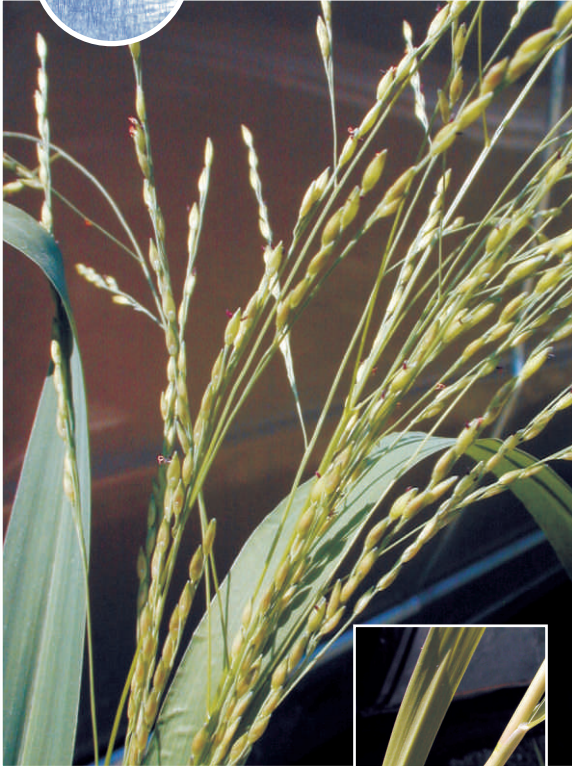
Panicum dichotomiflorum

🇨🇦 Distribution: NS, NB, QC, ON Flowering: June - October