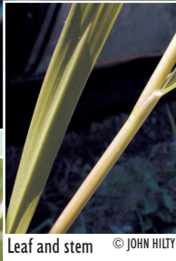
Leaf and stem