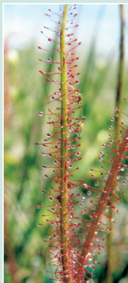
Long, straight leaf