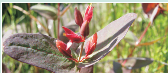
Purplish red leaves with no leaf stalks (sessile)