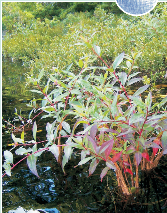
Late summer colours and arching stems