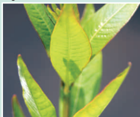
Circularly arranged leaves