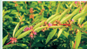
Flower clusters in leaf axils