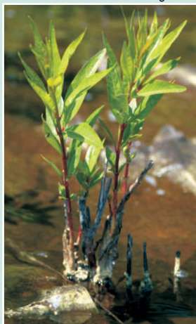
Regrowth after ice scour