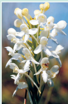
Flowers with long, slender spur