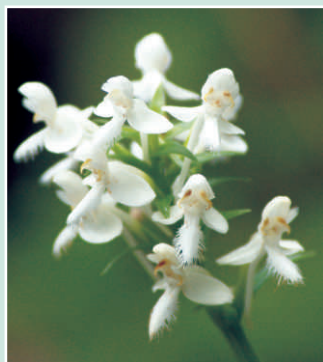
Eyelash-like fringed bottom lip

NOTES: Also known as Habenaria blephariglottis .