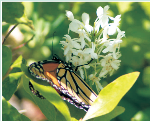
Monarch Butterfly feeding on the flowers