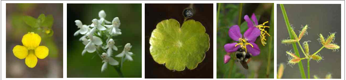
Golden-pert, White Fringed Orchid, Water-pennywort, Virginia Meadow-beauty, Toothed Flat-sedge.