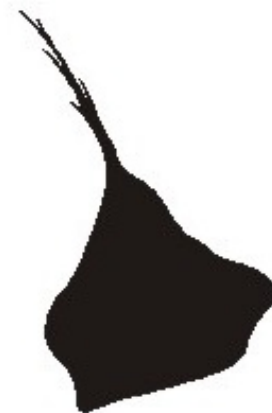
Ear of Canada lynx

Lynx have ear tufts and facial ruffs on their cheeks that are larger and more conspicuous than those on bobcats. Ear tufts are usually longer than 2.5 centimetres on lynx and shorter than 2.5 centimetres on bobcats.