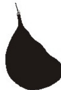
Ear of bobcat